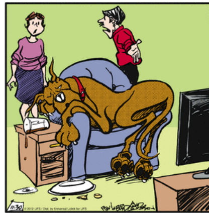
"I was gone thirty seconds and he drank my drink, ate my snack and fell asleep in my chair."